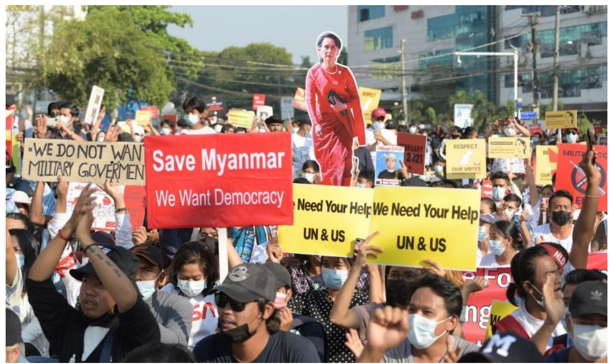
Demonstrators hold placards and a cutout with the image of Aung San Suu Kyiduring a protest against the military coup in Yangon, Myanmar, Feb. 15.