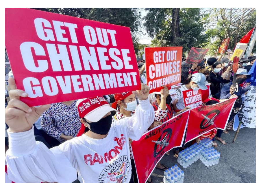
Protesters call for Beijing to stop supporting the military junta during a demonstration outside the Chinese embassy in Yangon last week.

The current political development in Myanmar has put China's involvement in questions. Rampant rumors circulating on social media continue to pinpoint Beijing as the culprit supporting the coup, and interpret anything related to China or the Chinese people as signs of China's interference. Protesters in Yangon have gathered near the imposing red doors of the Chinese embassy in the city, denouncing China for what they say is its support of the military coup. In addition, the protesters testified China's failure to take a strong stand against the coup. Anti-Chinese sentiment has risen rapidly in Myanmar over Beijing's stand at the U.N. Security Council (UNSC). Pro-democracy activists in the country have called for opposition to all Chinese projects in Myanmar. Some have even called for China's twin oil