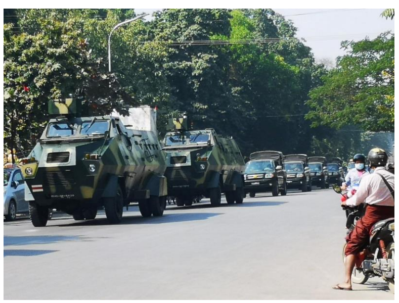
Myanmar Army armored vehicles drive along a street after they seized power in a coup in Mandalay, February 2, 2021

The USDP and military maintained their claims of fraud, going so far as filing a writ application at the Supreme Court and calling a lame duck session of the outgoing parliament. The new Parliament was scheduled to convene on 1 February 2021, for a planned session to confirm the new government. In the days leading to this event, speculation grew of a potential coup and, on 27 January, Myanmar's military chief Min Aung Hlaing warned that "the constitution shall be abolished, if not followed" and cited examples of previous military coups in 1962 and 1988.