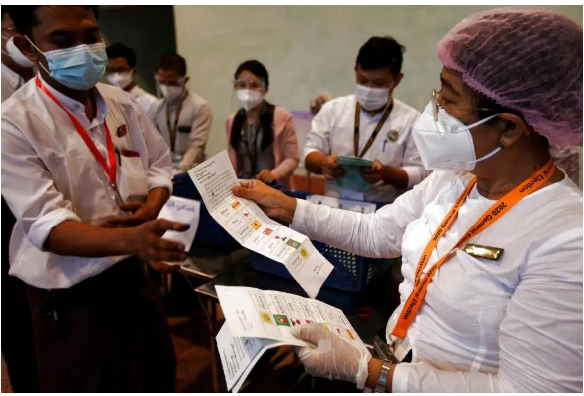
Officials of the Union Election Commission count votes during the multi-party general elections at a polling station in Yangon, Myanmar, Nov. 8, 2020.

Myanmar's Union Election Commission (UEC) published the official results of the election on 15 November 2020. The NLD secured a landslide victory, winning 396 seats across both houses (138 in the upper house and 258 in the lower house). This was well above the 322 required for a parliamentary majority. The military-backed USDP was second, winning a total of 33 seats across both houses. The remaining seats were shared between smaller regional parties while 25% of the seats in Parliament were reserved for the military by the country's 2008 constitution. The constitution also gives the military control of three key ministries - home affairs, defence, and border affairs.