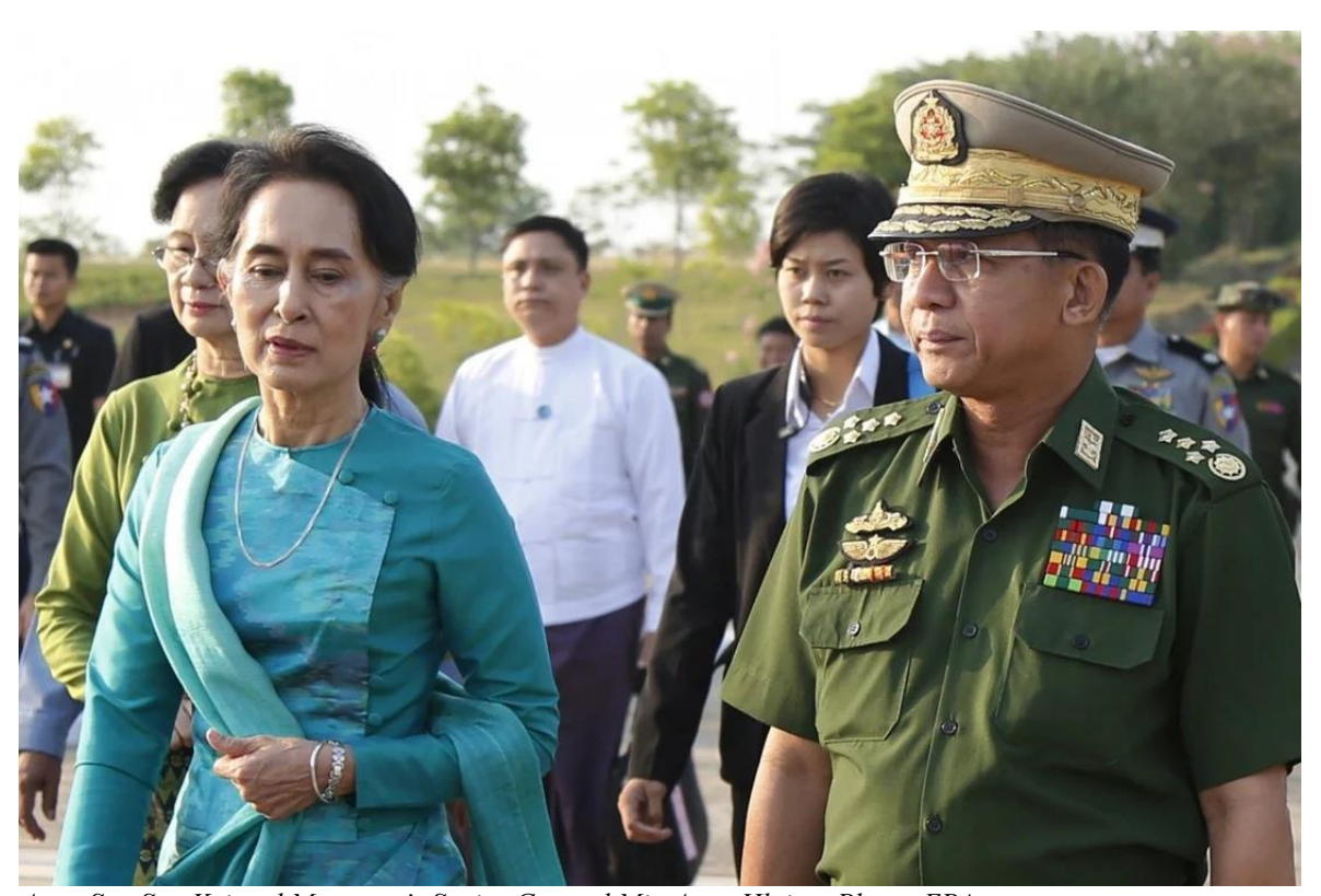
Aung San Suu Kyi and Myanmar's Senior General Min Aung Hlaing.

nothing. She has no name, she has no reputation, it's time to get her out of the way, that's what happened. They tore her to pieces and so where is she now? And where is Myanmar's democracy? Ten steps forward – just for the liberals in the United States to feel good tearing down a woman, they have gone 20 steps back for Myanmar's democracy,".